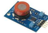
Fig. 5.3: CO sensor

The MQ2 flammable gas and smoke sensing element detects the concentrations of gas. It detects the carbon monoxide gas presence. It is measured in parts per million (ppm). Its operating range is 0-20000 ppm. It consumes low power. It has small form factor. It has long life and it is stable. It is available in high volume. The drive circuit is extremely simple. It has wide detecting scope.