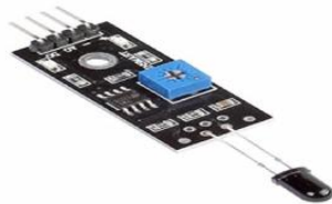
Fig. 5.1: Fire sensor

Fire sensor is a simple and compact device that is used for sensing and protecting against hearth. It uses IR sensor and comparator to sense fire up to 1-2 meters of ranging depending on fire density. It consists of 3pins ground, vcc, and out. It consists of led which is used as fire indicator. For adjusting range calibration preset is used.