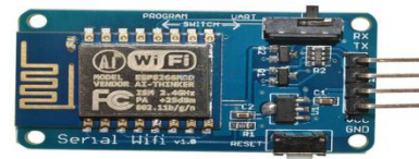
Fig. 5.4: Wi-Fi module

It is a occasional price WIFI microchip. It follows TCP/IP stack. The capability of microcontroller is created by shanghai based Chinese manufacturers ESPRESSIF systems. It is terribly low price and it has terribly external parts on the module. It might terribly cheap in volume several hackers square measure drawn to explore the module, chip and software on it.