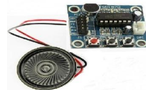
Fig. 5.5: Voice module

In this switching is done between traditional broadcasting and voice alarm broadcasting. The control status indicators, output circuits and power provide is checked by this module. When auto feedback is set then the module will transmit feedback signal mechanically to the panel when it switches to fireplace alarm broadcasting. Voice modules are used in fire alarm systems to provide pre-recorded and manual voice messages. Voice modules are the unit systems that gives response personnel with the power to conduct orderly evacuation and apprise the persons present in that place. It will occupy one address. It will be changed through a handheld engineer or fireplace alarm control panel(FACP). It is loop powered mode. It is plug in structure. When the output circuit is brief then it will report fault message to manage panel once it is watching output circuit is brief then it will report fault message to the panel once it is watching output circuit in power on state [13].