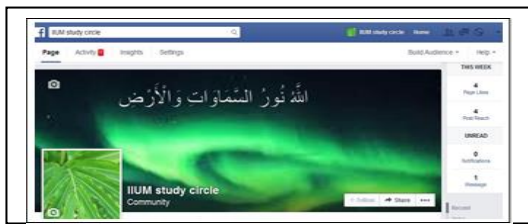
Fig. 3: This study's Facebook page

this study created page shows the aurora in the Lofoten Islands of Norway and an excerpt of Surah Noor, Ayah 35. This is a symbol of the Islamic world view that believes the "Light of God" as the source of knowledge. The philosophy of illumination is a doctrine according to which the process of human thought needs to be aided by divine grace. The verse 35 of Surah Noor has a very interesting meaning related to this doctrine. This Illuminations school of Islamic philosophy believes that the mind needs to be enlightened by light from outside itself so that it can participate in truth because it is not itself the nature of truth. The Persian philosopher Shahab al-Din Suhrawardi (1155–1191), founded the school of Illumination[15-17]. The profile picture shows a green leaf that is the symbol of nature and another source of knowledge in the Islamic world view. The cover photo and profile picture highlight two important sources of knowledge and ways of connecting to God: the Quran and nature (see figure 3).