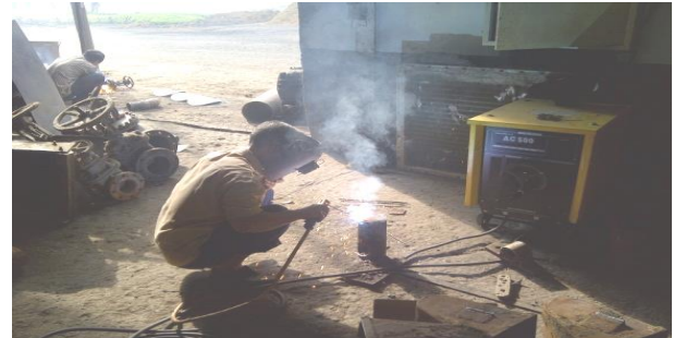
Fig. 1: Assembling Tools.

The following is a documentation of the work sequences that have been carried out from assembling to the installation of oil capping devices on a fat pit tub.