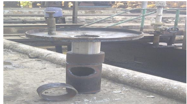
Fig. 2: Skimmer.