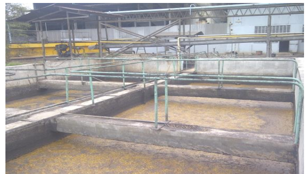
Fig. 3: Condition Before Repair.

After the entire series of repair works has been completed, what is expected is a contribution that can be given to the company. There are 2 (two) forms of contribution received by the company, namely technical contribution and financial contribution. A. Technical Contributions. In the implementation of the improvements that have been made, there are some technical contributions that have been obtained by the company, namely: