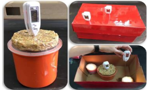
Fig. 4: Heat Insulation Test Set-Up.

The heat insulation test is performed by placing the samples on top of a calorimetry cup inside a cardboard box where 2 candles are lit (as a source of heat). The temperature difference between the calorimetry cup and the environment is recorded every 5 minutes over a period 25 to 30 minutes to be later used in the K factor calculations.