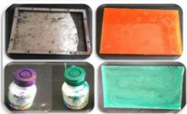
Fig. 2: Epoxy and Polyester Layers Preparation.