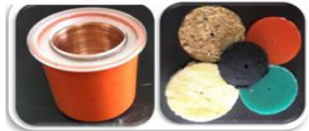
Fig. 3: Heat Insulation Test Samples Preparation.