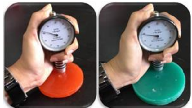
Fig. 5: Hardness Shore D Test.

The hardness test is performed using a Schmidt Shore D hardness device. The needle tip of the device is immersed into the sample of polyester and epoxy until the base of the needle is aligned with the surface of the sample. The analogue metre reads the hardness value in Shore D as in figure 5 below. [3].