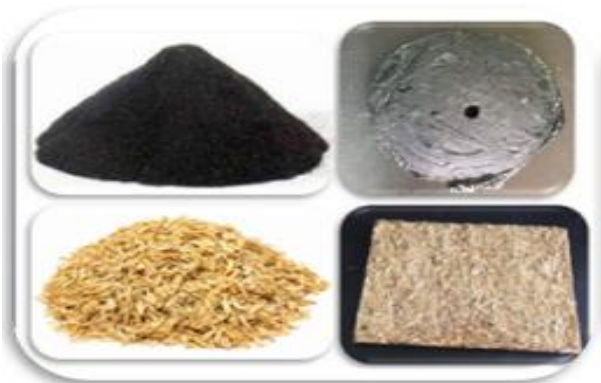
Fig. 1: Automobile Tire Powder and Rice Husk Mixed with Epoxy Preparation.

The automobile tire powder is mixed with epoxy (3:1 by volume) and left to cure in a steel 30 cm x 20cm x 1 cm mould for 24 hours. The same procedure is repeated but using rice husk. A polyurethane reference sample is prepared by mixing together equal volumes of di-isocyanate and diol. Then a sample of pure epoxy and a sample of pure polyester are prepared (for the tile's top layer) by adding the respective resins to the hardener (in case of the epoxy) and to the initiator and activator (in case of the polyester)[8]. The samples are left for 3 days to cure completely. A sample of each of the automobile tire mixture, rice husk mixture, epoxy and polyester is prepared in a petri-dish to prepare for the heat insulation test.