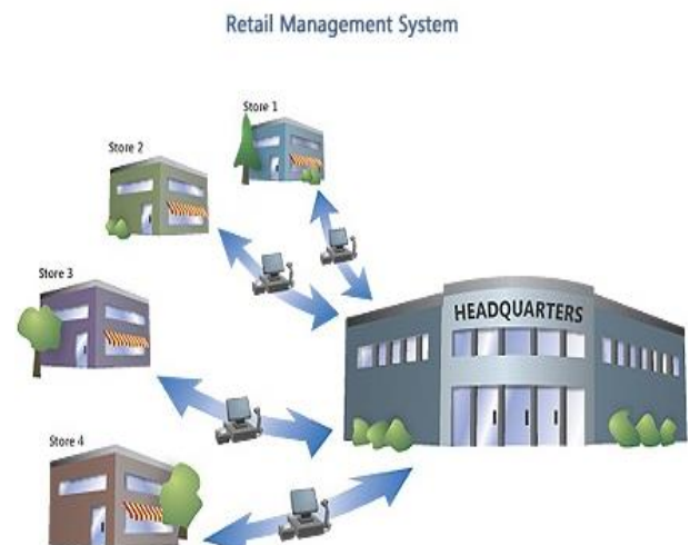
Fig. 1: Overview of a Retail Management System.

The performance of a management system mainly depends on the easy way of accessing data from anywhere in the environment. Here the easy data access represents the minimum amount effort to be implemented to mine any kind of data from the database or warehouse in a secured manner. A very famous line is quoted like "Much of the data described is difficult for us to obtain, and at the same time we do not have the capacity to try to find it" [4], so we have to give more concern on easy data access and retrieval for a faster communication process.