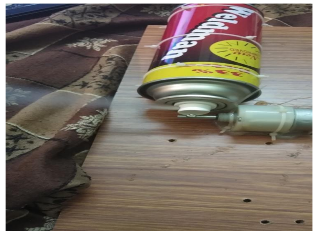
Fig. 5: Gas Releasing Cylinder.