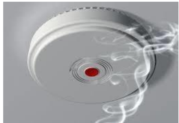
Fig. 1: a) Smoke Sensor.

The Temperature sensor enacts when fire came out. The picture of temperature sensor demonstrated as follows.