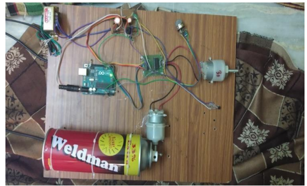
Fig. 3: B) Hardware Design when Smoke Detected.