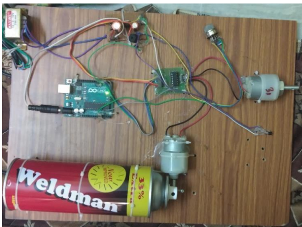
Fig. 3: A) Hardware Design When Smoke Detected.