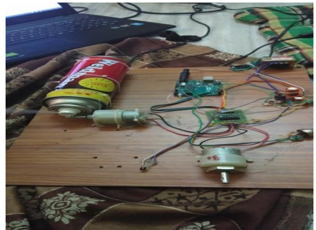
Fig. 4: Hardware Design When Gas Is Released from Cylinder.

The Future scope for this application would be to implement this method on a pipeline water spray to avoid human loss when large fire accidents occur or at war times, where human rescue operations are essentially required.