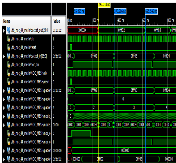
Fig. 2: Simulation Result of Islip Scheduler.

It gives latency of 6clk cycle for each node data transfer. Design works for maximum operating frequency of 72 MHz.