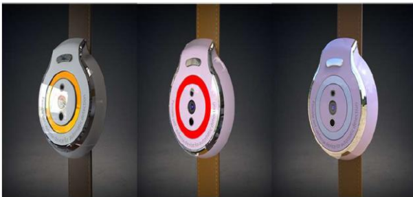
Fig. 9: Final Output of Prototype.

Final output of prototype is shown in Figure 9.