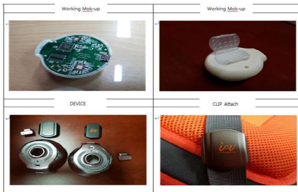
Fig. 8: Mock-Up and Device.

Screen of manufacturing working mock-up and device is shown in Figure 8.