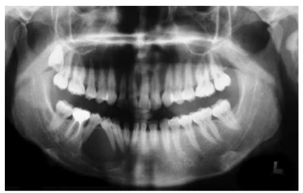
Fig. 1: Digital Panoramic Radiograph Reveals Triangular Radiolucent Area Involving Roots of Mandibular Right First and Second Premolar.

In view of this clinical appearance, the initial management consisted of partial removal of the lesion (incisional biopsy), which confirm the diagnosis of SOT. Then, total resection of the tumor and curettage were performed, followed by the using demineralized freeze-dried bone allograft and collagen membrane to fill defect.