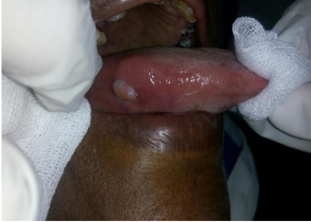
Fig. 2: Growth on Right Lateral Tongue Border.

nopathy was undetectable. The lesion was provisionally diagnosed as an irritation fibroma with a superficial traumatic ulceration. The clinical differential diagnosis included a fibrosing pyogenic granuloma with superficial ulcer and TUGSE. Excisional biopsy was done. On microscopic examination, the epithelium was stratified squamous parakeratinized and the connective tissue indicated dense chronic inflammatory cells with stromal eosinophilia. The histological impression, concluded TUGSE.