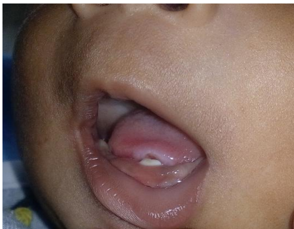
Fig. 3: Ulcerated Lesion on Ventral Anterior Tongue Surface.

A 7 month-old male infant accompanied by his mother reported, with a chief complaint of ulcer of the tongue and associated difficulty in feeding since 1 month. The anamnesis was non-contributory. On intra oral examination, a neonatal tooth that was white and immobile was recorded in the mandibular anterior region. An ulcerated lesion was noted on the midline of anterior ventral surface to the tongue, 8mm in diameter. Its margins were regular and edges were pale and rolled-out. The base was indurated and floor, covered with fibro-purulent membrane. It was clinically diagnosed as Riga-Fede disease. Excision and biopsy was not performed considering the age of the subject and the resultant discomfort to tongue.