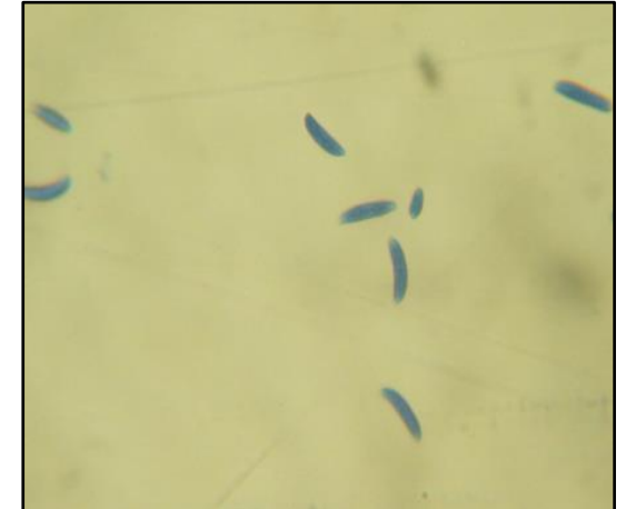
Fig. 1: Microscopic View of Different Phosphate Solubilizing Fungal Species Isolated from Mine Soil