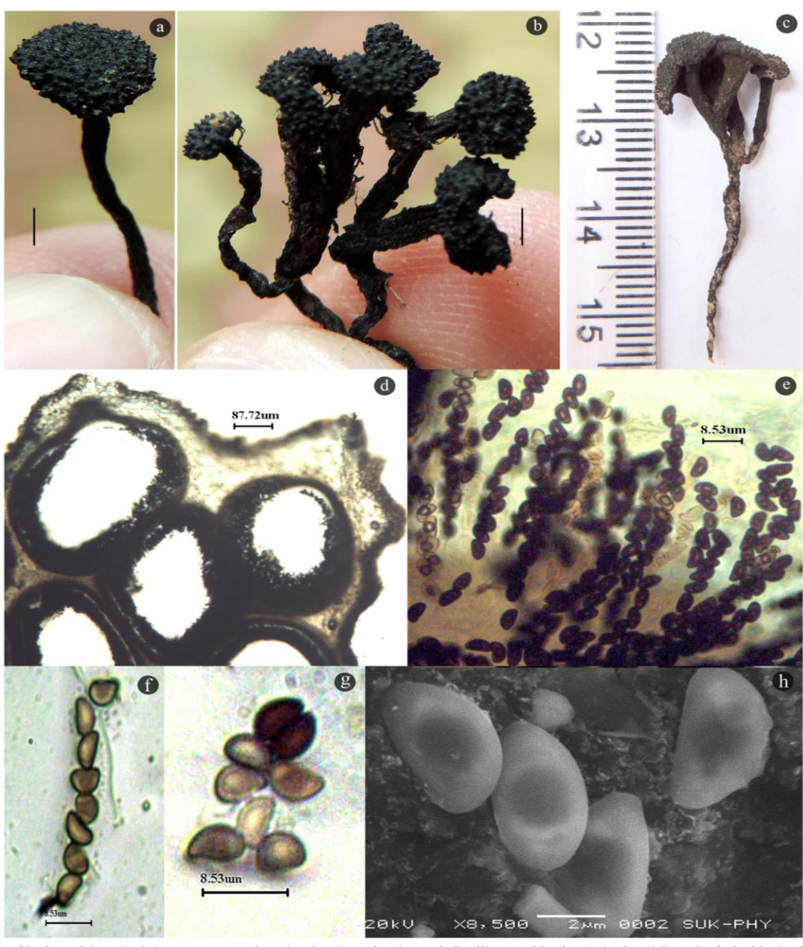
Plate no. 1: Poronia radicata Hembrom, A. Perihar & K. Das.