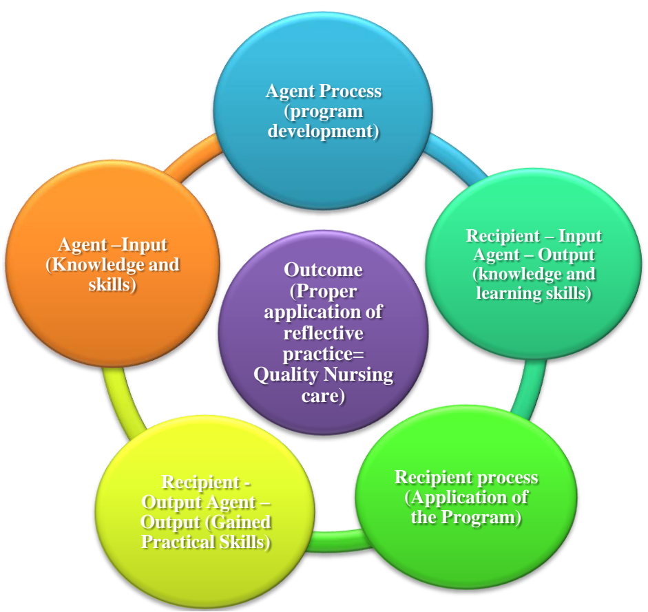
Fig. 4: Structural Process of Reflective Practice

'Terminus' is the final goal or finishing point of the process. The purpose of this article is to develop a conceptual framework for facilitation of reflective practice programme for registered nurses in clinical settings. Registered nurses should adopt and implement this programme in order to understand the reflection-in-action during the activity and reflection-on-action after the performance of the activity. These are the important components of reflective practice which can be applied in order to improve the registered nurses' daily practice for the provision of quality nursing care. Here the feedback or the output is expected from both parties—the giver (an agent) and the receiver/recipient. The outcome of this would be the proper implementation or application of reflective practice based on proper knowledge and skills which lead to provision of quality patient care (see Figure 4 below).