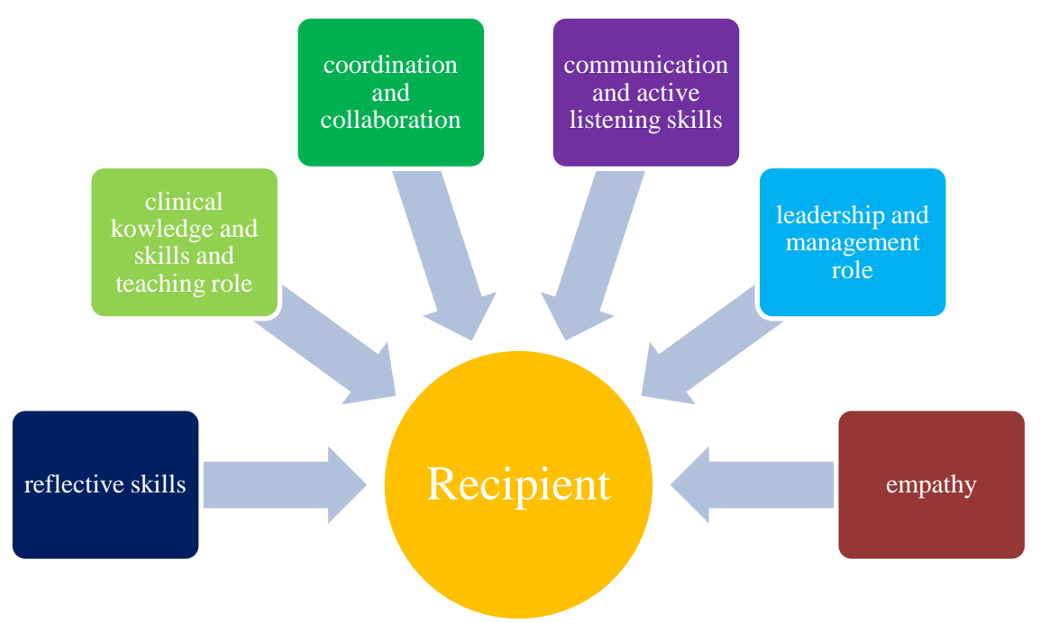
Fig. 3: The Characteristics of the Recipient (Registered Nurse)